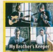
My Brother's Keeper